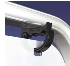
Panel Hanging Clip