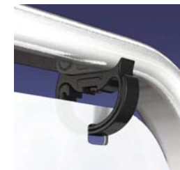
Panel Hanging Clip