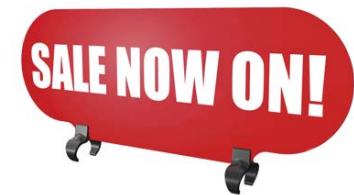
Add a Tactical Header

A great way to add extra promotional space for minimal expense & effort