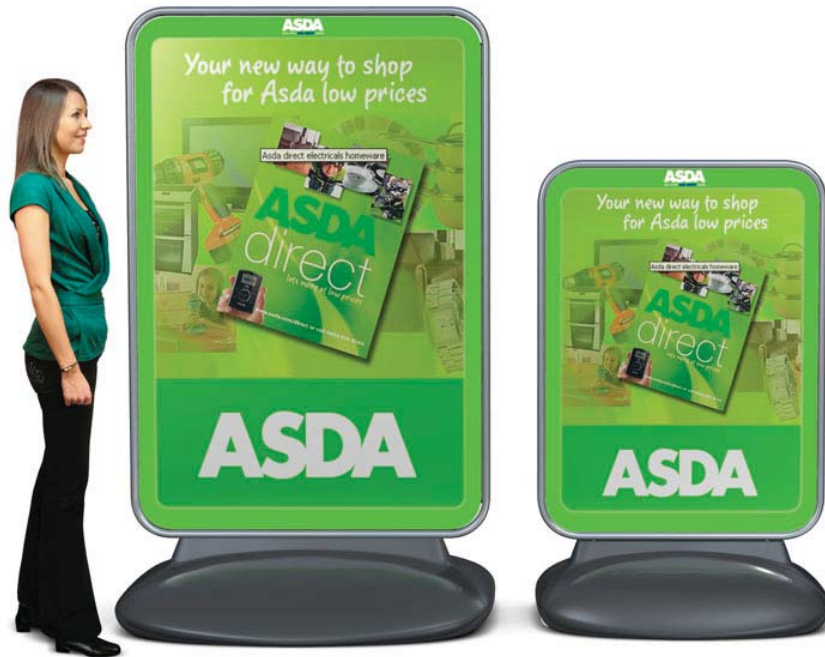
40" x 60"

Purpose made trolley for easy moving around site